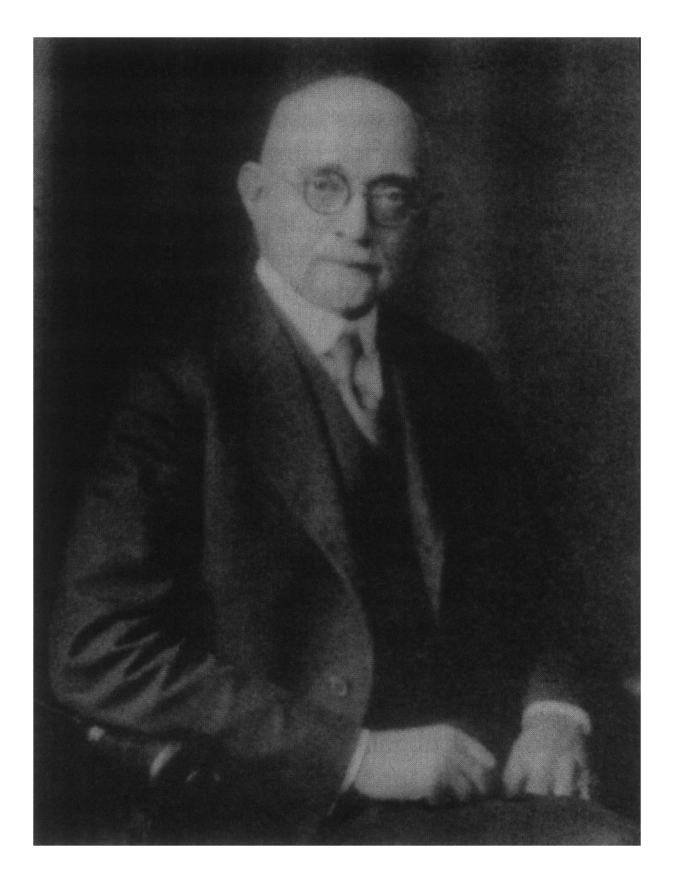
Joseph A. Hill, the chief statistician of the Census Bureau, was chairman of the committee that devised immigration quotas according to the national origins of the American people, as mandated by the Immigration Act of 1924.

fornia, a civic forum devoted to discussion of policy issues, on "Immigration and Population" carried the subtitle, "The Census Returns Prove That Immigration in the Past Century Did Not Increase the Population, but Merely Replaced One Race Stock by Another."<sup>22</sup>